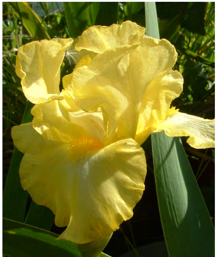
right: 'Magic Quest' (Tasco 2007)