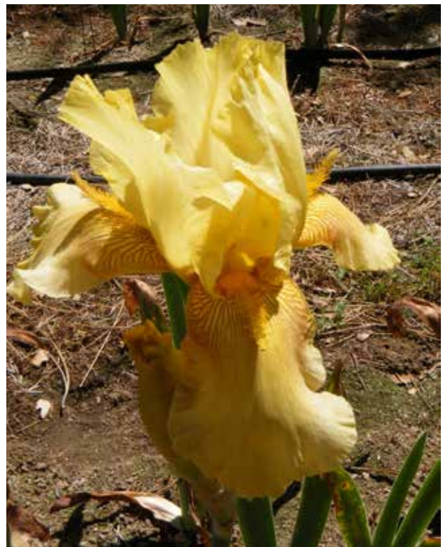
above: Moon Ranger (Austin 1965)

A Sydney B Tradition! We have members who for various reasons find it difficult or impossible to come to meetings. One of the issues is transportation. This could become a nice SBM tradition -- inviting, and arranging to bring, members to our meetings. Makes everyone happy!