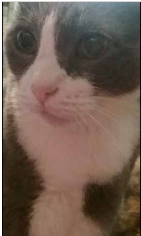
right: Emma Sofia, Presidential Cat

October 25: Beardless iris auction and sale