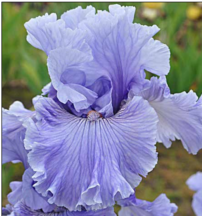
(above): Ocean Liner (Keppel 2017)