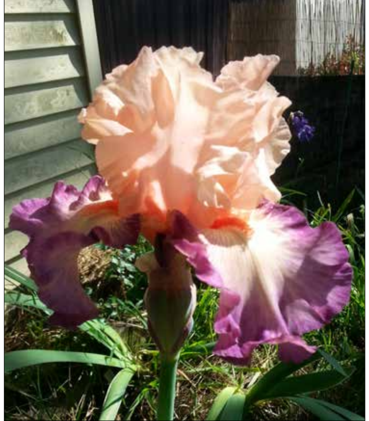
above: Path To Heaven (Ghio 2016) below: Vibrato (L. Painter 2015)