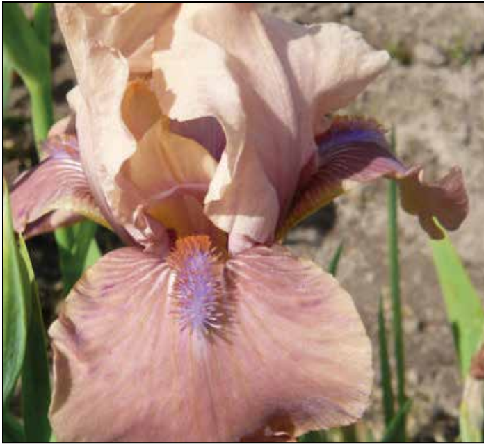
(above): Rust Never Sleeps (Lauer 2016) IB