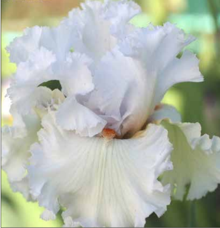
above: Angels Abound (Kerr 2014) below: Give It Away (Lauer 2016)