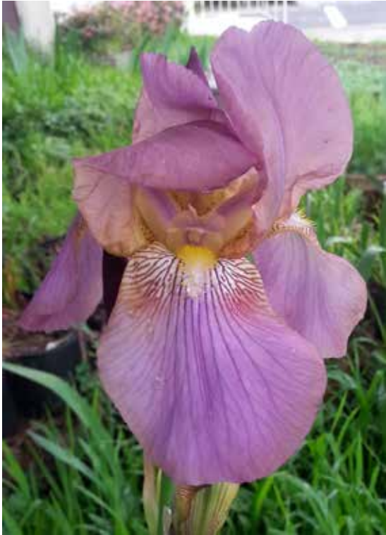
(above): Miss California (Salbach 1937)