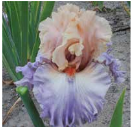
left top: Who Needs a Prince (Schreiner 2013)