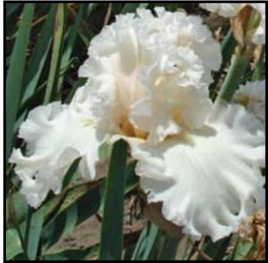
left top: Berry Fulfilling (Schreiner 2013) left middle: Dramatic Encounter (L. Painter 2014)