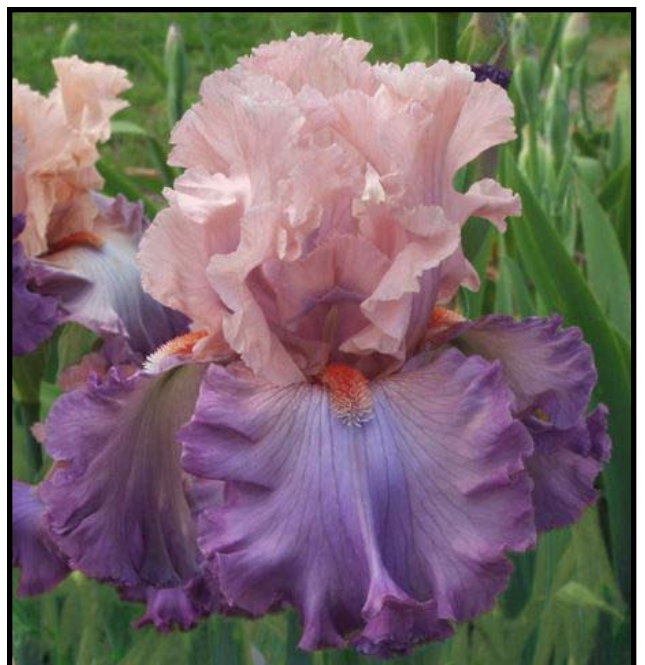
on page 1: Leave the Light On IB (Probst 2013)