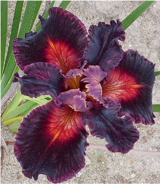
Red Light District (Ghio 2015)