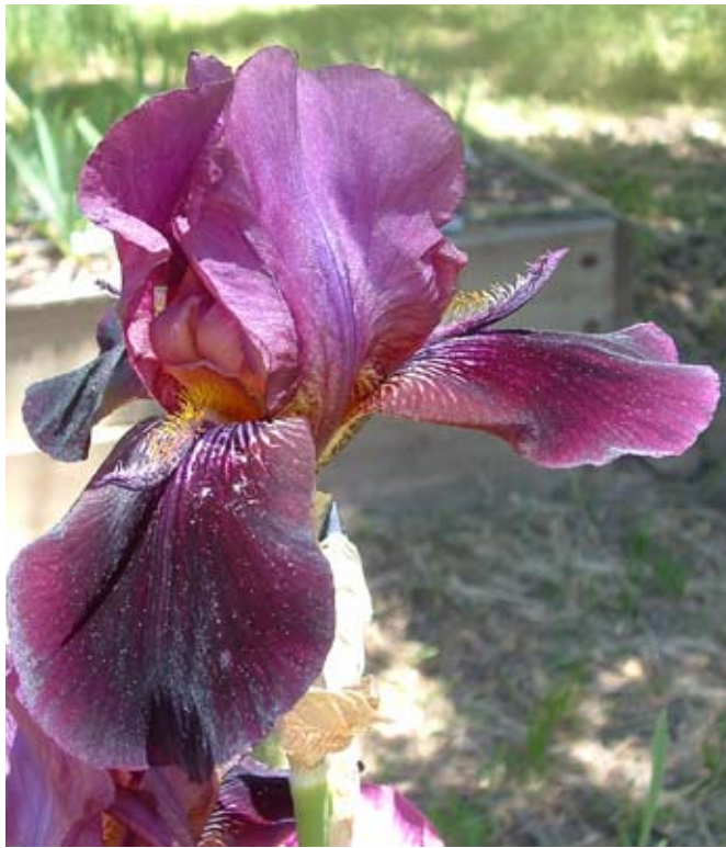
(above): Black Hope (Austin 1963)