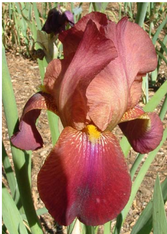
2 above: Crimson Repeater (Austin 1964)