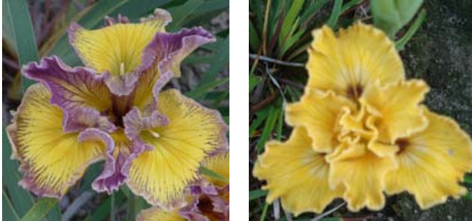
Border Dispute (Ghio 2014) PCI [above, left]