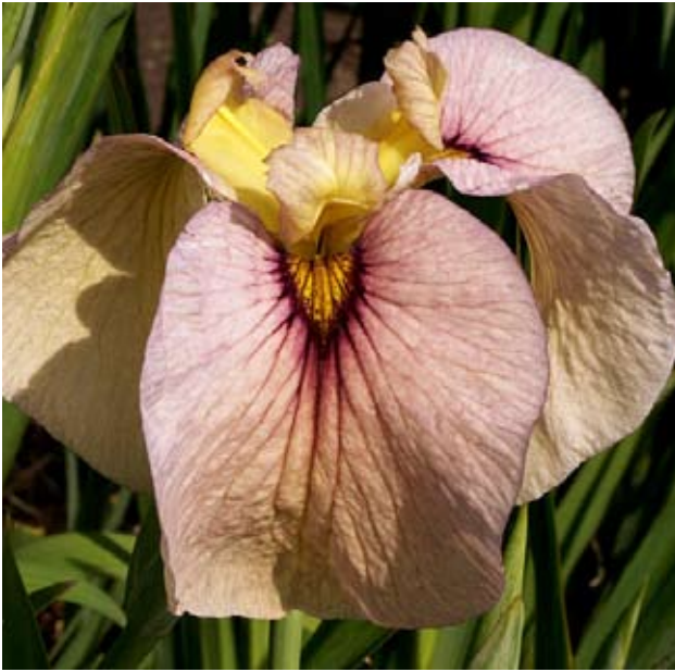
Kinshikou (Shimizu 2004)