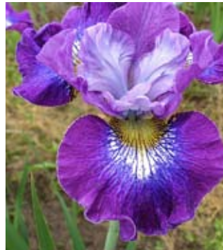
Ruffles And Flourishes (Hollingworth 2002) Tet. Ruffled red-violet with blue halo and white wire rim on falls [left]