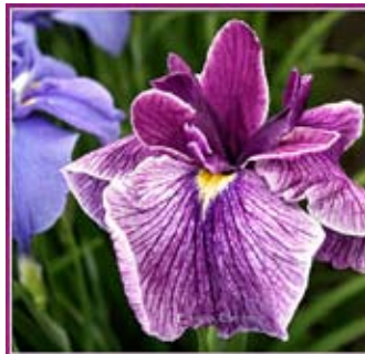
Freckled Peacock (Harris 2002) 3F. S white, thin rv edge; F white, speckled and rimed rv [left]