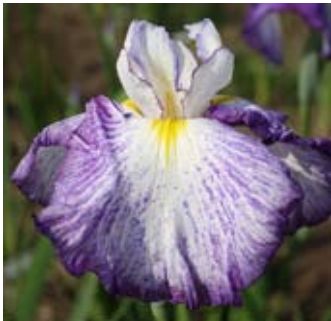
Glitter And Gayety (Payne 1964) 3F. S. red-purple; Falls are white with heavy red-purple veins [right]