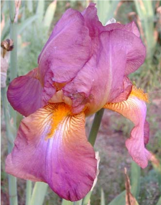
(above): Miogem (McKee 1947)