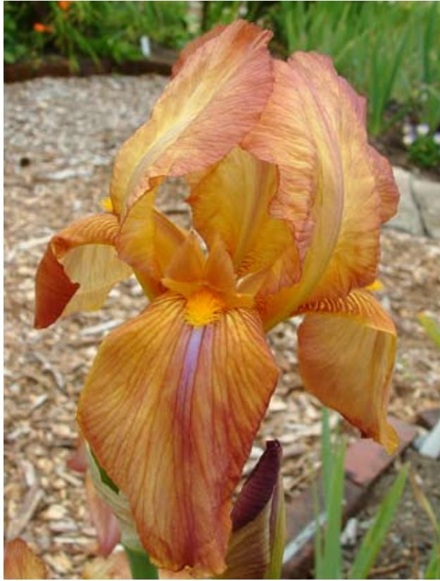
Golden Flare (Insole 1931)