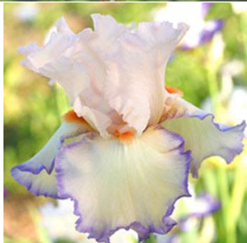
image above Queen's Robe , from http://rainbowacres2.homestead.com/2011-introductions.html

My personal favorite of this year's introductions. The standards are erect and ruffled and of a baby ribbon pink with slightly darker center. The style arms are pink as well. The ruffled and semi-flaring falls are a slightly lighter pink than the standards and even lighter around the beards. The hafts are dark pink. Falls edged with a narrow band of baby boy blue. All this a tons of personality to boot.