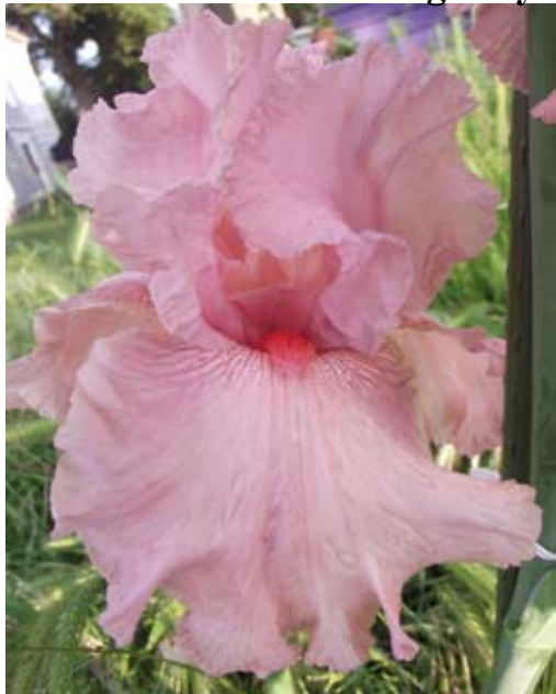
above: 'That's Hot' (Lauer 2008)

NO meeting in April -- our show is May 5th, and we also have a meeting May 25th