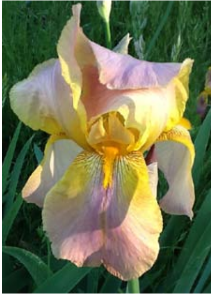
Easter Bonnet (Maxwell-Norton 1943)

www.facebook.com/#!/pages/Sydney-B-Mitchell-Iris-Society/116888028332187?ref=ts