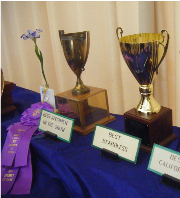
above: Trophies at last year's show