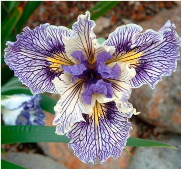
(Grisso seedlings,)