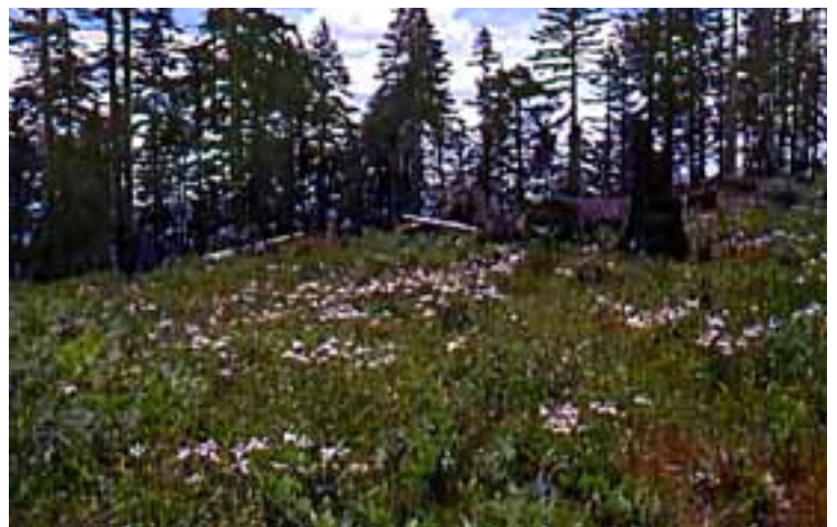
Iris in mountain meadow, Claude Derr

Thanks to www.pacificcoastiris.org/default.html for the photo below ~ Iris in mountain meadow, Claude Derr