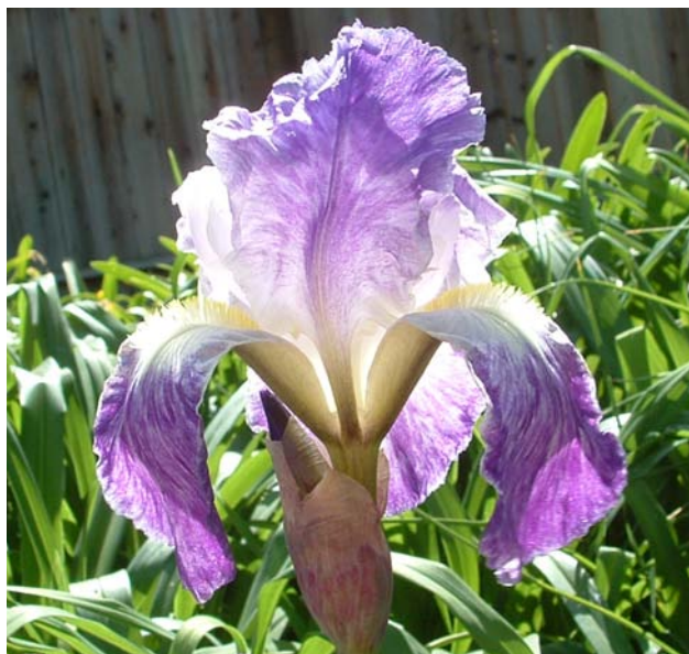
Pretty Pansy (Sass 1946/x)