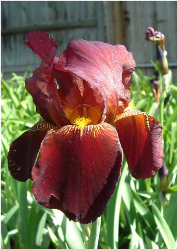
ORELIO (DeForest 1947)