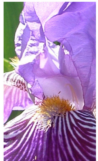
Monsignor (Vilmorin 1907)