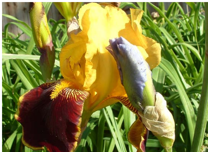
Staten Island (K. Smith 1947) w bud of Pacific Mist (Schreiner 1979)